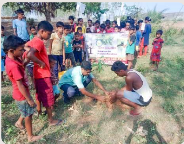
● Organising co-curricular events