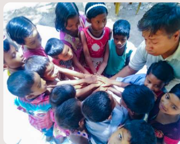
● Organising community based events on importance of school regularity.